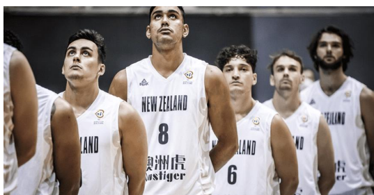
Tall Blacks vs India - 28 th February 2022 New Zealand 95 India 60